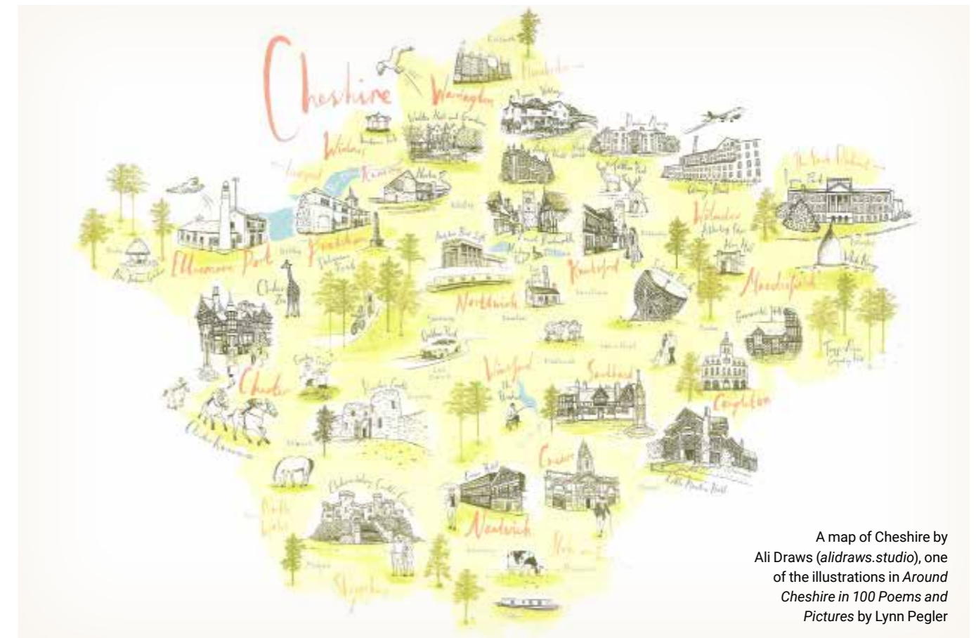
A map of Cheshire by Ali Draws ( alidraws.studio ), one of the illustrations in Around Cheshire in 100 Poems and Pictures by Lynn Pegler